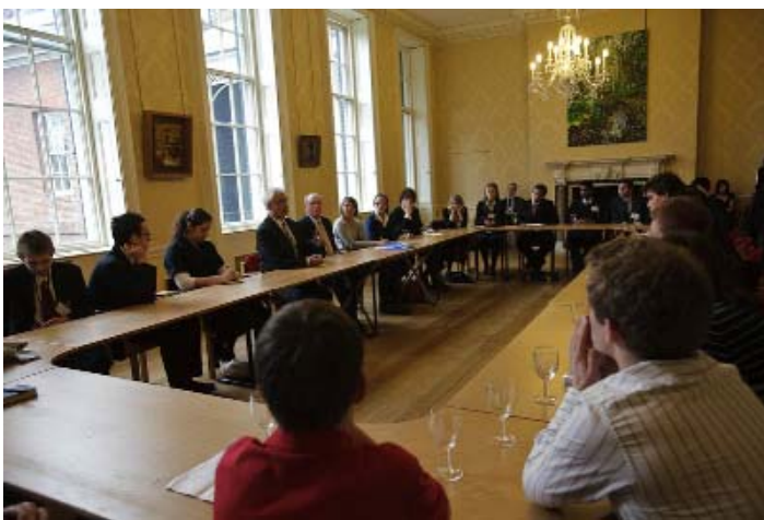
Discussing the financial crisis with the Chancellor At Downing Street