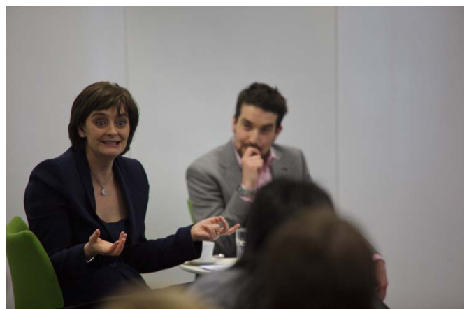
Cherie Blair answering questions at the Conference