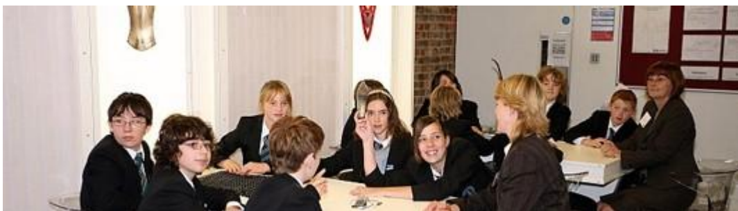
Pupils at the Tower of London Materials Workshop

50 year 11 students attended a one-day visit to the Tower of London to study materials on 10 th Feb, helping them with their GCSE units on the topic. They examined old and new materials and took part in 5 practicals where they had the chance to touch and understand why different materials are so good for their functions. It was an enjoyable and educational day out from school.